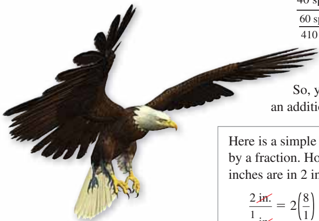
The bald eagle was once listed as an endangered species. In 2007, it was removed from the list due to success in protecting the species.

So, you could estimate that it might take about 270 years for an additional 40 species of mammals to become extinct.