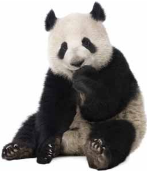
The giant panda was listed as endangered in 1990.

It is estimated that about 125 species of birds and 60 species of mammals have become extinct since 1600. There are approximately 1000 species of birds and mammals that are currently facing extinction. Including all types of plant and animal species, the number of endangered species is around 20,000.