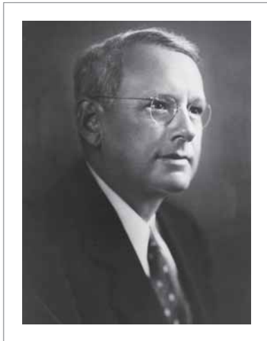
Alfred Mossman "Alf" Landon (1887–1987) was the 26th governor of Kansas. He was the Republican nominee in the 1936 presidential election.