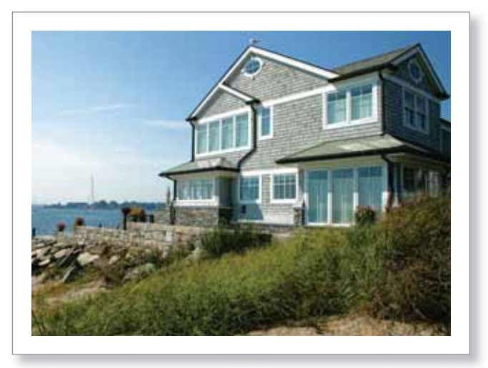
Connecticut has the second-highest property taxes per person in the United States, behind only New Jersey. It is also the most recent state to adopt an income tax (1991).